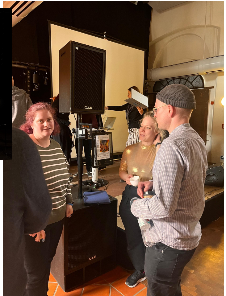
Meeting the students