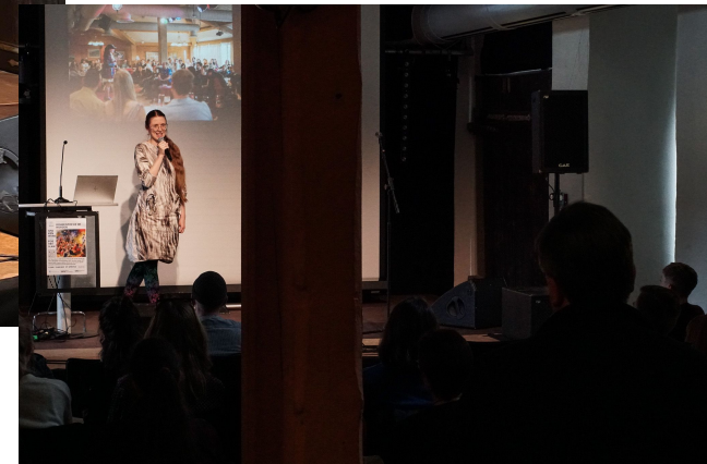
Readings on Infoforum